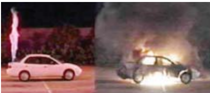
Photo from a video that compares fires from an intentionally ignited hydrogen tank release to a small gasoline fuel line leak.

Hydrogen is no more or less dangerous than other flammable fuels. However, its unique characteristics should be viewed as advantageous. Hydrogen is lighter than air and therefore it rapidly disperses in the event of a leak. This minimizes the possibility of accumulation and ignition. In the event that hydrogen does ignite, its flames generate low radiant heat due to the absence of carbon. This makes hydrogen substantially safer than conventional hydrocarbon fuels (such as gasoline) for users and first responders in the event of any accident.