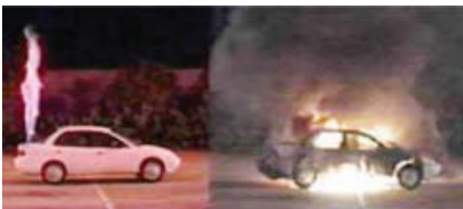
Photo from a video that compares fires from an intentionally ignited hydrogen tank release to a small gasoline fuel line leak.

Hydrogen is no more or less dangerous than other flammable fuels. However, its unique characteristics should be viewed as advantageous. Hydrogen is lighter than air and therefore it rapidly disperses in the event of a leak. This minimizes the possibility of accumulation and ignition. In the event that hydrogen does ignite, its flames generate low radiant heat due to the absence of carbon. This makes hydrogen substantially safer than conventional hydrocarbon fuels (such as gasoline) for users and first responders in the event of any accident.